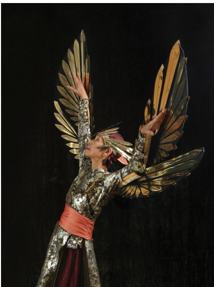
Peggy Choy, FLIGHT: torn like a rose .